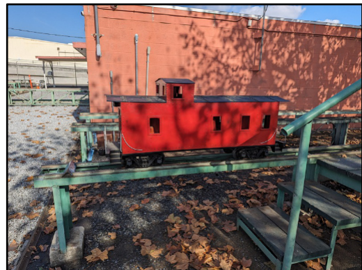
Charlie is asking $25,000 for the whole set.