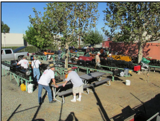
(Fall Meet 2015)

There's a sign-up sheet on the soda machine in the club house for volunteers to cook breakfast on Saturday and Sunday, Train crews for the Sunday public trains, and anyone planning to camp in the compound who can provide security. If there's no one staying in the compound, all trains will have to be put away and the compound secured at the end of the day.