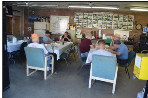
(Fall Meet 2016)

We're going to try something new this year. Boy Scout troop 40 will be selling lunch on Saturday from around 11 O'clock until the food runs out. Revenue from the lunch goes to the scouts, with no cost to the club. With the scouts doing the cooking, there should be no need for RLS members to take time away from running trains. The railroad will still have water, sodas, and ice cream for sale in the club house. That saves everyone from having to shut down their engines to run in to town for lunch. If it works out, we may expand it on future meets to dinner on Saturday and / or lunch on Sunday. Let the board and the scouts know what you think. Two of the scouts are junior members of RLS and two of the leaders are members. This is a fine time to introduce the boys to the live steam hobby.