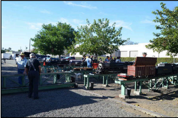
(Fall Meet 2017)

October is here already, and that means the fall meet is only three weeks away. The weather is finally starting to cool, so it should be a fine weekend for running trains and visiting with old friends.