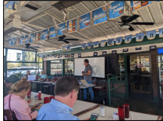
(2021 RLS Annual luncheon)

This year the RLS luncheon will be held Saturday, January 28th at the Riverside Marriott. Social hour at 11:30am with lunch at noon.