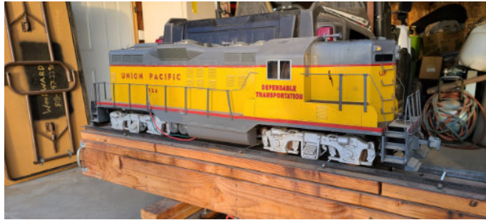
GP9, Powered 1" scale $8,000

1" scale version of this workhorse locomotive. Whether you're fascinated by multi-unit diesels or just want a lazy day alternative to your steamer, this GP9 is your answer.