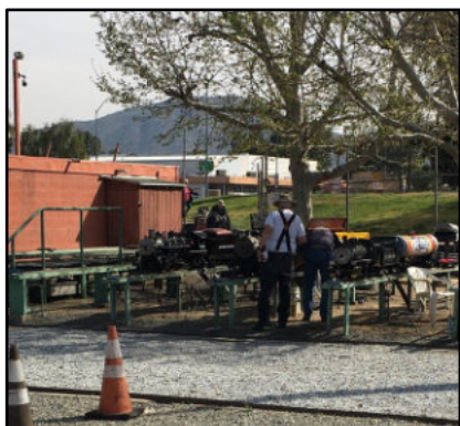
Getting all steamed up

I arrived at 7:45 AM at Riverside Live Steamers for the March 13 run day. I immediately took the two dozen donuts into the clubhouse and placed them on the table for members to enjoy. As I turned towards the coffee pot I noticed no one had made coffee. I sprang into action cleaned the coffee