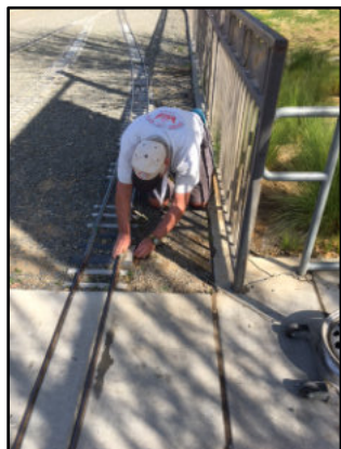
Quick signal repair

I opened the storage bins and took out the golf carts. I was notified by a concerned member that I had not put the flags up. I put the flags up. I then did a track inspection of the mainline. I was notified by one of the first engineers out on the line that spikes were missing and rail was out of