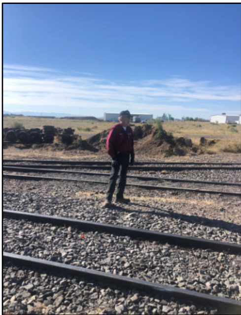
Guess Who? Our Brakeman for the day