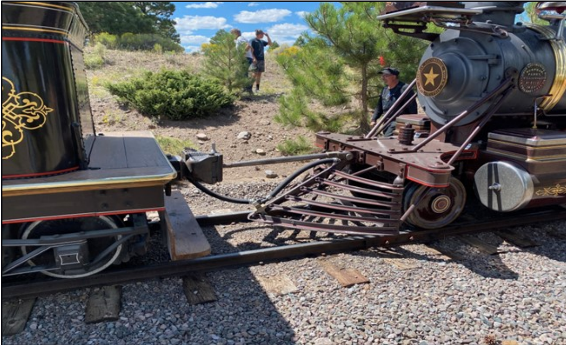
A close up of the drawbar at Big Horn Wye approximately 30 miles west of Antonito, CO.