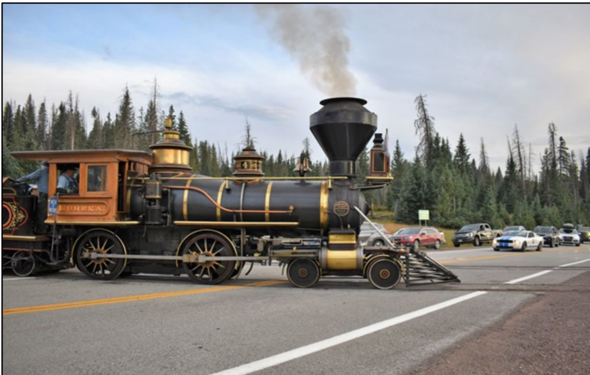
On another day after we left for California, the Eureka & Palisade can be found blocking traffic at Cumbres Pass. The last time an American 4-4-0 did that was 120 years ago!