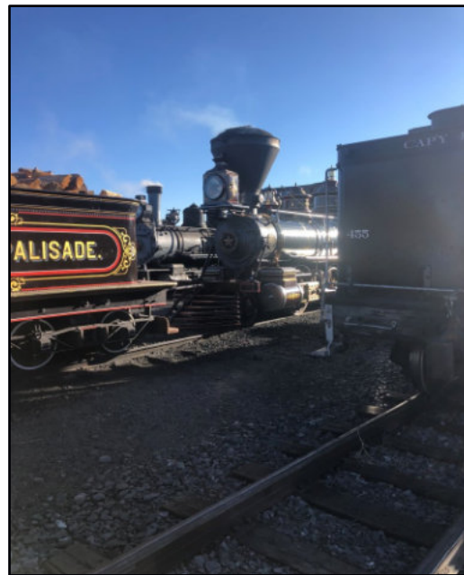
An Interesting Perspective