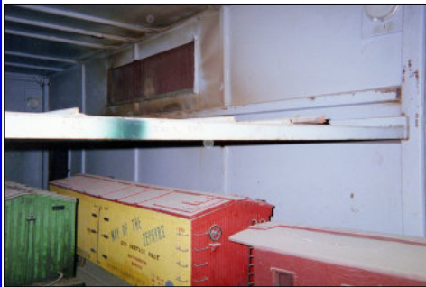
Yellow and Red Box car for $1000.