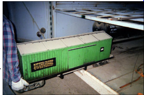
Green Box Car for $500.