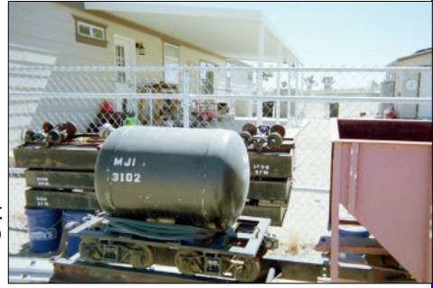
Small black tank car for $200