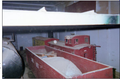
Brown wood caboose $500