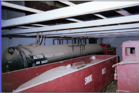
Wood brown hopper car for $300