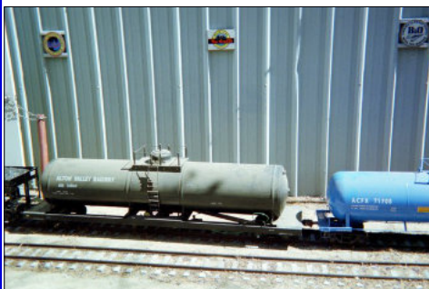
Two Black tank cars each one is $2500.

Please email Gail Woodward: gail080953@yahoo.com Subject: Trains