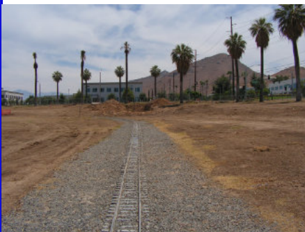
Top Left: The view north along Marlborough looking at what was the tunnel location.

Here are a few more shots of the beginning of the Hunter Park renovation in 2010.