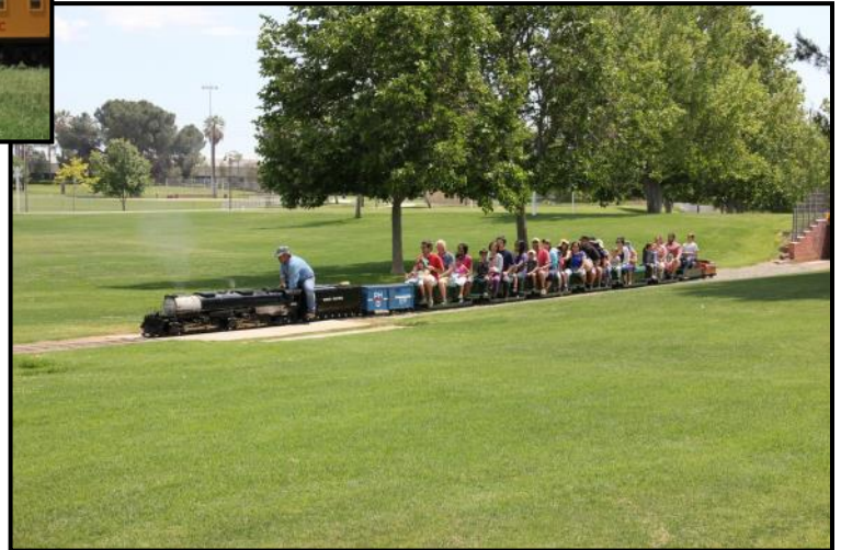
The Big Boy pulling passengers out of Allen's Valley