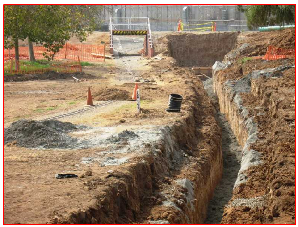
Little Tracks... BIG trench

If you were to have traveled down to the club on October 16<sup>th</sup> and just happen to have seen one of the gates into the park open, you would have been mortified by the sight of deep trenches running hither and thither for hundreds of yards. As of this printing, the giant trenches are all filled in, leaving one to think it was simply a bad dream.