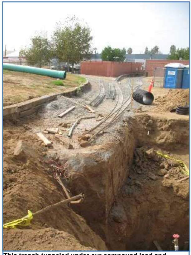
This trench tunneled under our compound lead and mainline then headed into Allen's Valley. Fortunately, it's completely buried now.

Even though the picture on the front cover of this edition of the Chronicle is alarming, that particular area of the park has been restored to "mostly-normal": there's still a few smaller open trenches by the wig-wag crossing, Palm Garden, and the Vanden-berg Grade. Those are all scheduled to be buried soon. But the trenches aren't the real problem preventing us from having at least one run day this month. The problem is the final amount of re-grading that needs doing. As you read in Bill Hesse's W.O.W, the contractor replaced and ballasted most of the track they removed for the trenching projects. Now, it up to us to align, level and tamp those areas. Also, a number of spots need to be reworked due to inactivity and the occasional nudge received the construction equipment.