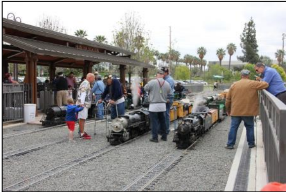
May 13th, Run Day—Busy at the Station

We have tried to provide enough safety stuff - rule books, chocks on the steaming bays, white wooden blocks on the hoist, look around they are all there. The most important thing about safety is the individual person doing whatever it is; from running on the railroad to loading equipment on the hoist has to THINK "what can go wrong, and how do I prevent it?" all the time, not just when the Safety Weasel is in sight. Who knows, it may be your time next time for the Steam gods to toy with you but you can thwart their evil intentions by thinking SAFETY FIRST.