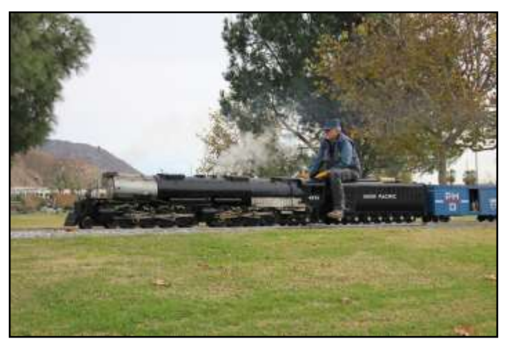
Above: There is lots of activity in and out of the Compound leads